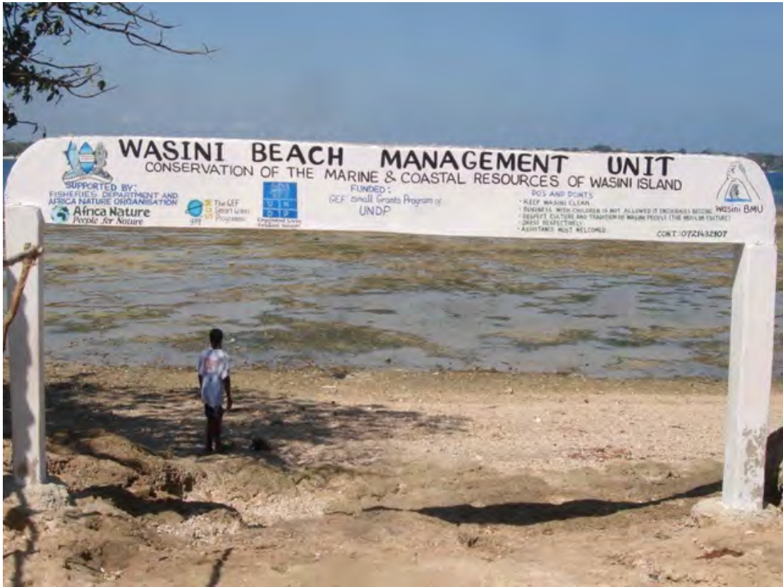
The sign board at the Wasini village beachfront.

29. Fitwel Brands, Kenya (Private Company)