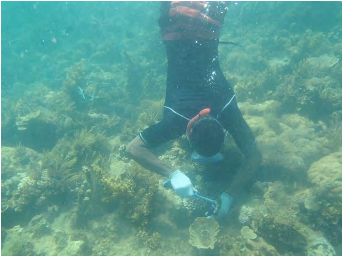
Coral transplant project in Wasini village, Kwale County, Kenya