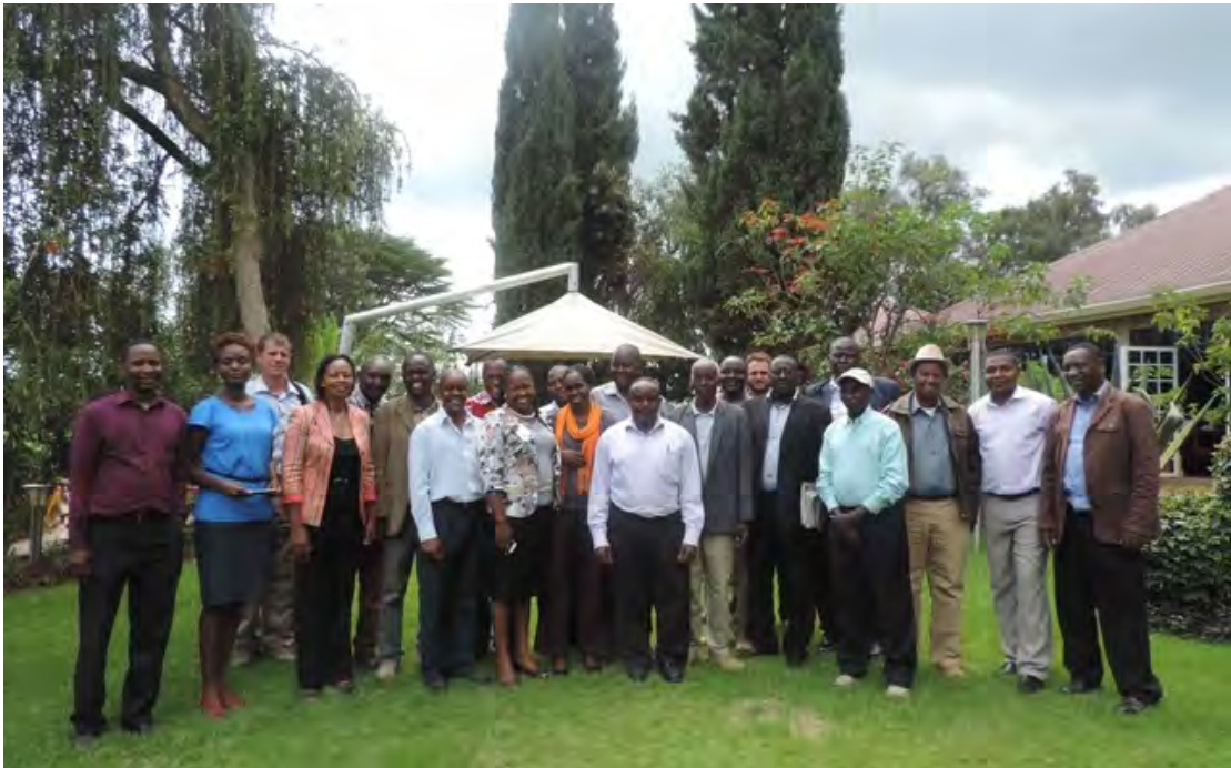
Group photo: Laikipia County Wildlife and Compensation Committee members attending a sensitization workshop on new Wildlife Act.