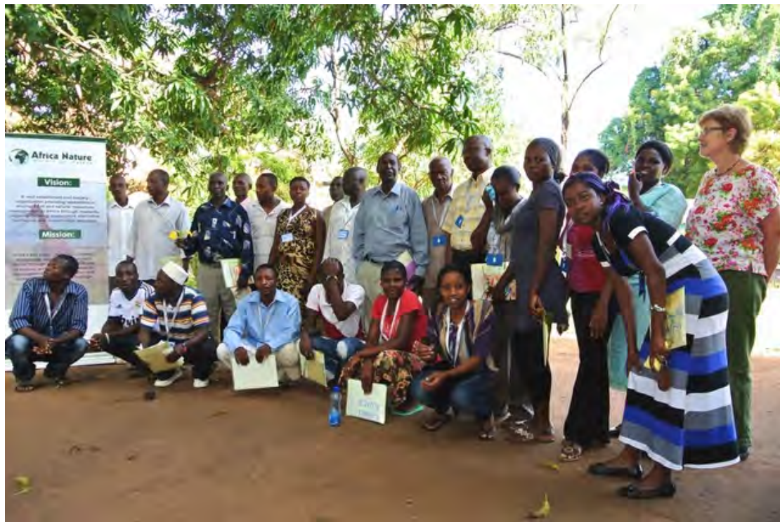
Group Photo: Participants of a multi-stakeholder workshop on sustainable management of Madunguni Forest Reserve, Kilifi County, Kenya.

The award recognizes an individual(s) who was instrumental in connecting the Secretariat to various networks and organizations, which advanced the realization of various objectives of Africa Nature Organization and People4Nature Global.