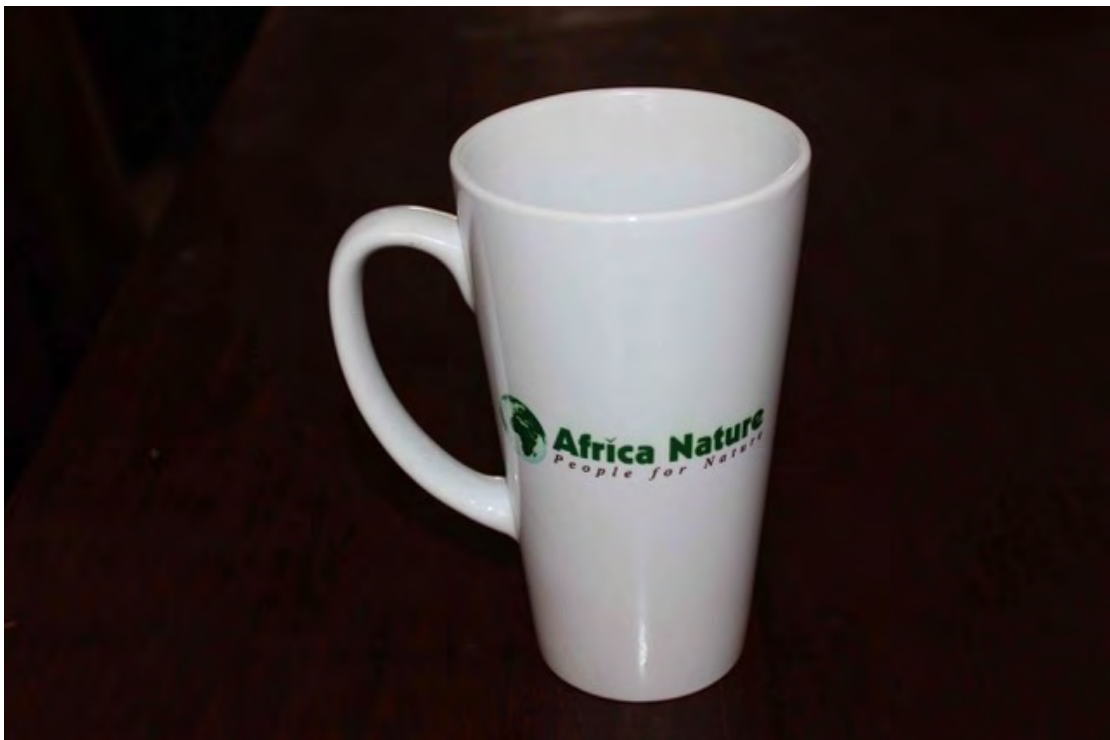
A mug, one of the many branded items by Fitwel Brands Ltd.

29. Fitwel Brands, Kenya (Private Company)