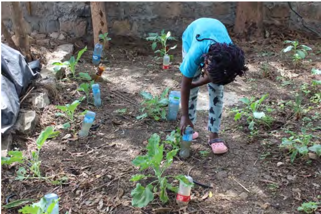
Cidi Ngowwa inspecting the water levels of re-usable water bottles at her vegetable kitchen garden.